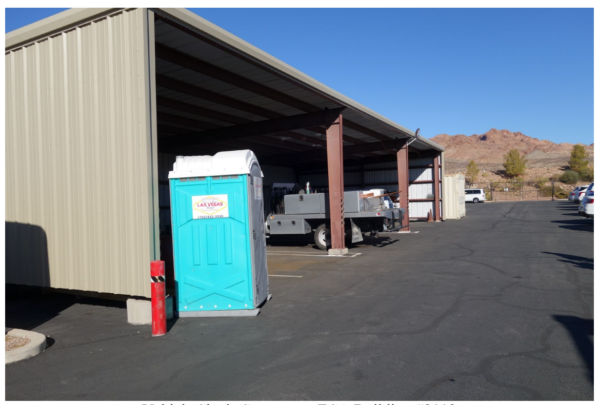
Vehicle Shade Structure – FCA Building #3112 Description: Exterior of the Structure.