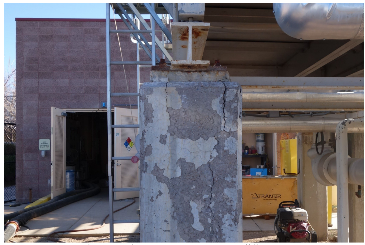
Southern Nevada Veterans Home – FCA Building #2106 Description: Cooling Tower Pier Replacement Needed.