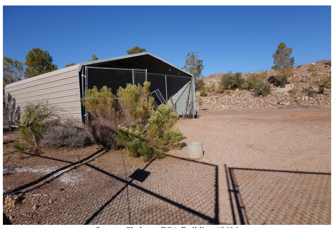
Storage Shelter – FCA Building #0614 Description: Exterior of the Structure.