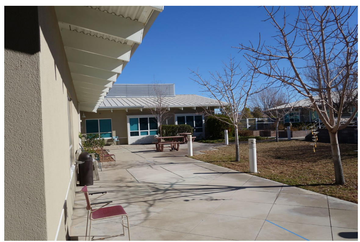
Southern Nevada Veterans Home – FCA Building #2106 Description: Typical Residence Patio Area.