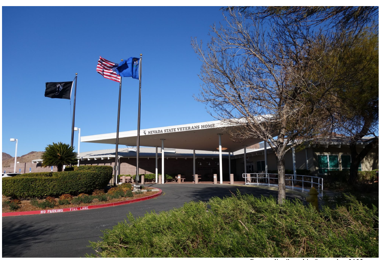
Report distributed in September 2022