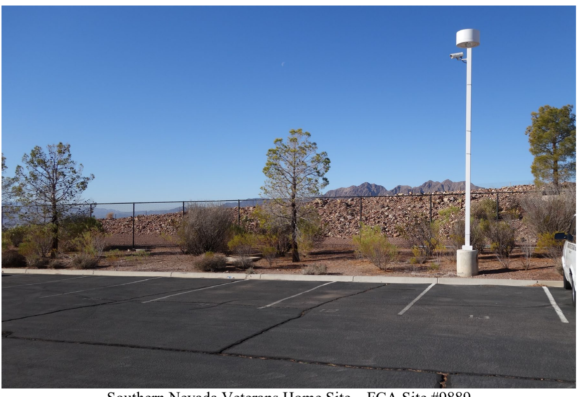
Southern Nevada Veterans Home Site – FCA Site #9889 Description: Video Surveillance Upgrade Needed.