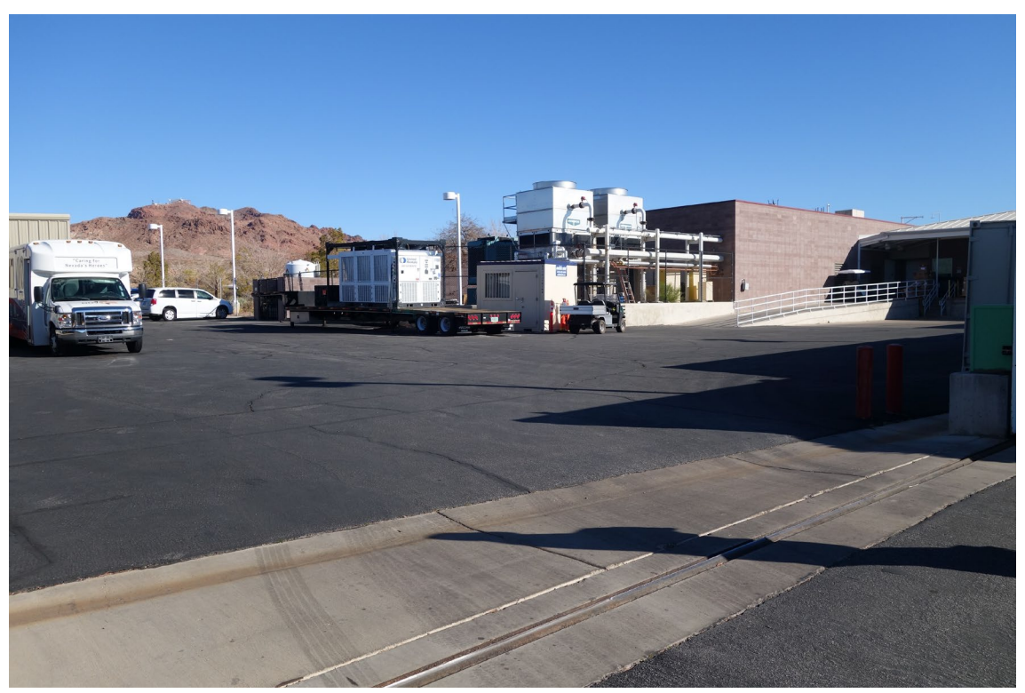
Southern Nevada Veterans Home Site – FCA Site #9889 Description: View of Loading Dock Area.