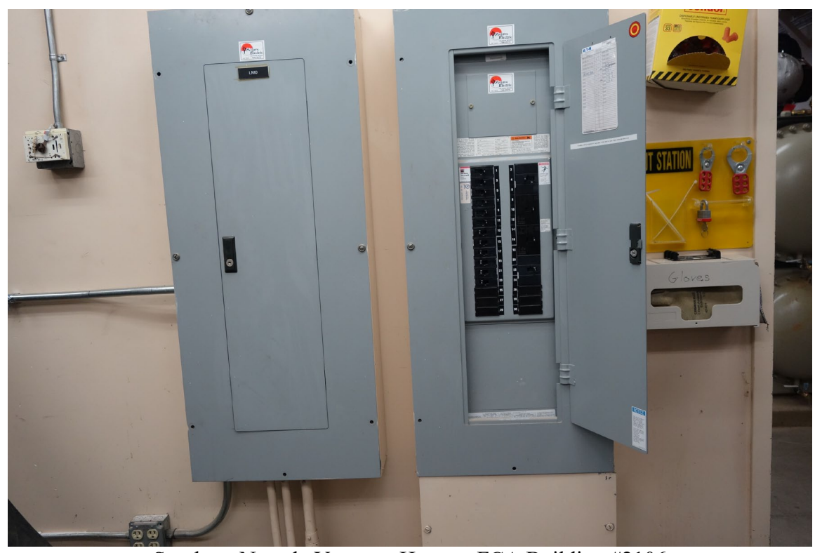
Southern Nevada Veterans Home – FCA Building #2106 Description: Arc Flash & Electrical Coordination Study Needed.