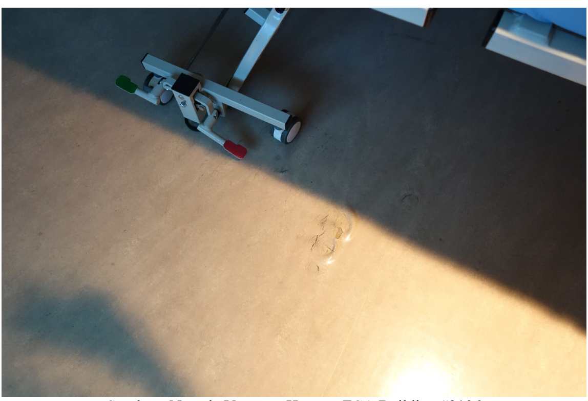
Southern Nevada Veterans Home – FCA Building #2106 Description: Flooring Replacement Needed.