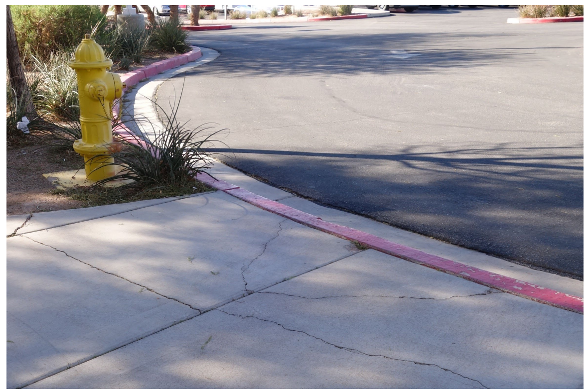
Southern Nevada Veterans Home Site – FCA Site #9889 Description: Sidewalk Replacement Needed.